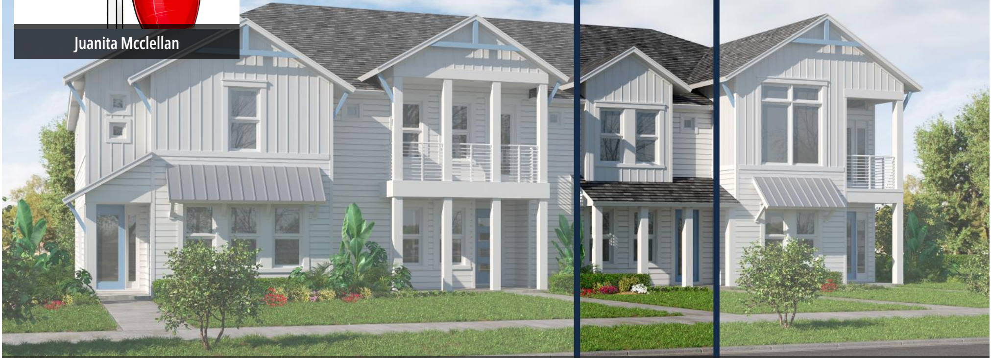
THE DELEON - D at NOCATEE