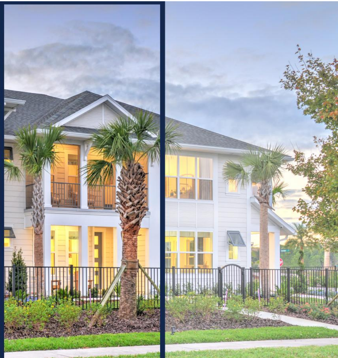
THE CASTILLO - WEST INDIES