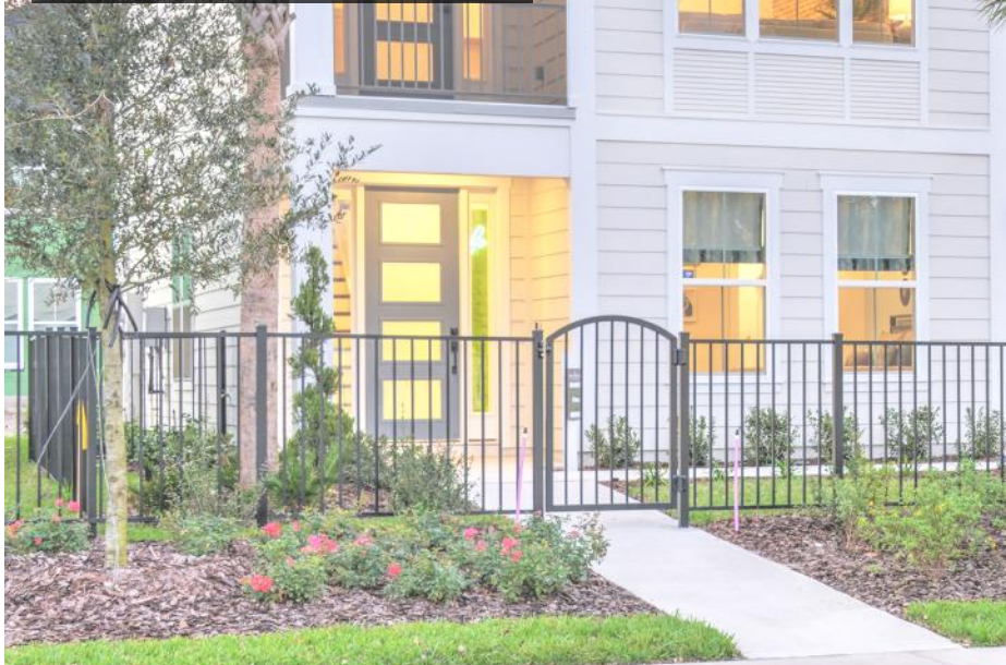
THE CASTILLO - C at NOCATEE