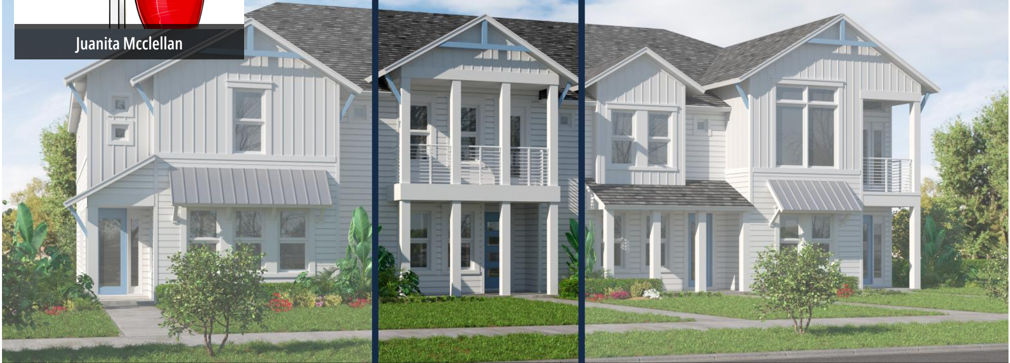
THE CASTILLO - C at NOCATEE